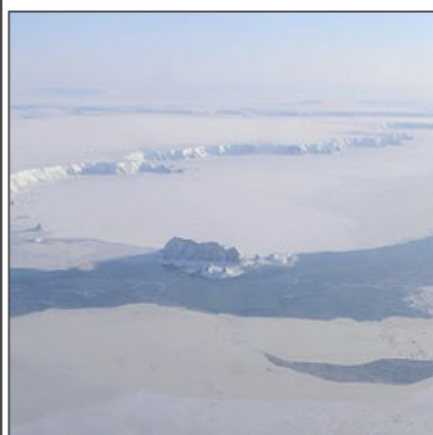
Magadanskaya coastline where Dimitri Kieffer is trekking (as photographed by him from the airplane). Dimitri told ExplorersWeb, I am safe from the tsunami! I am still quite a bit inland. Just got a lot of precipitation (snow).