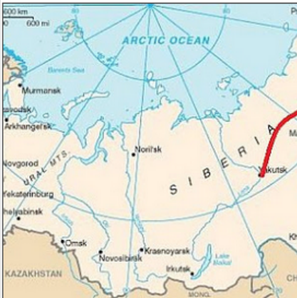
The route: Omsukchan, Magadanskaya Oblast to Yakutsk in the Republic of Sakha (Russia)